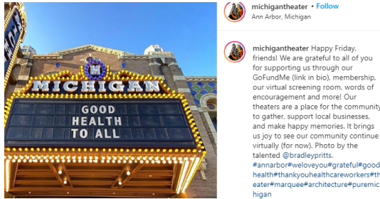
Figure 1: Interaction on Instagram